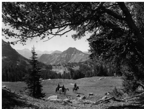
K. D. Swan photographs like Vista of Wounded Man Lake , taken in Custer National Forest, in 1938, are the focus of the Society's newest exhibit, Splendid was the Trail .

http://www.fs.fed.us/r1/centennial/swan.shtml .